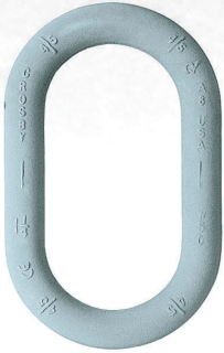
A-342CT Master Links