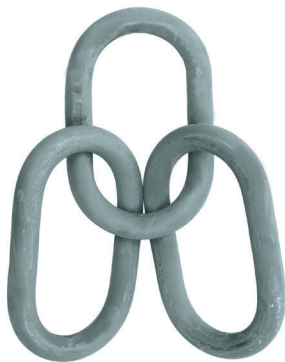
A-345CT Master Links Assembly

*Minimum Ultimate Load is 5 times the Working Load Limit.