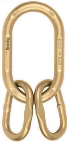
A-345 Alloy Master Links