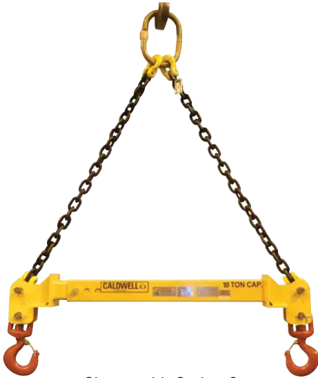
Shown with Option C