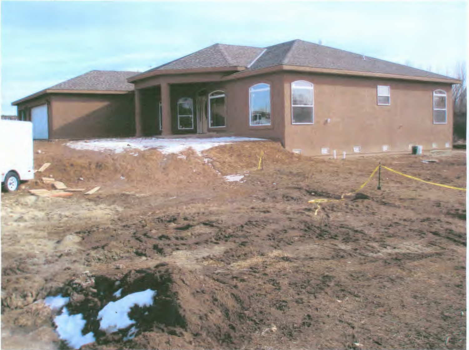
Front and West view