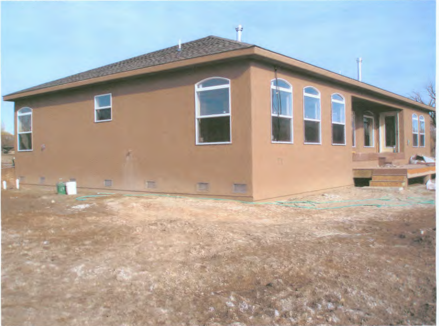
Rear and West view

If submitting more photographs than will fit on the preceding page, affix the additional photographs below. Identify all photographs with: date taken; "Front View" and "Rear View"; and, if required, "Right Side View" and "Left Side View."