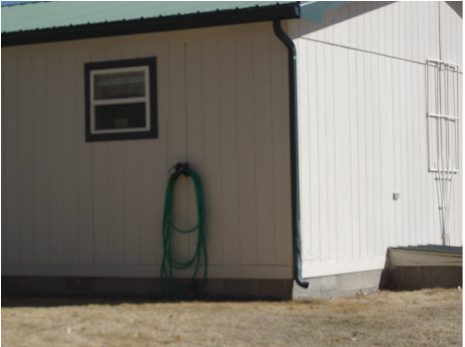
Back of structure looking East 2/26/13

If using the Elevation Certificate to obtain NFIP flood insurance, affix at least 2 building photographs below according to the instructions for Item A6. Identify all photographs with date taken; "Front View" and "Rear View"; and, if required, "Right Side View" and "Left Side View." When applicable, photographs must show the foundation with representative examples of the flood openings or vents, as indicated in Section A8. If submitting more photographs than will fit on this page, use the Continuation Page.