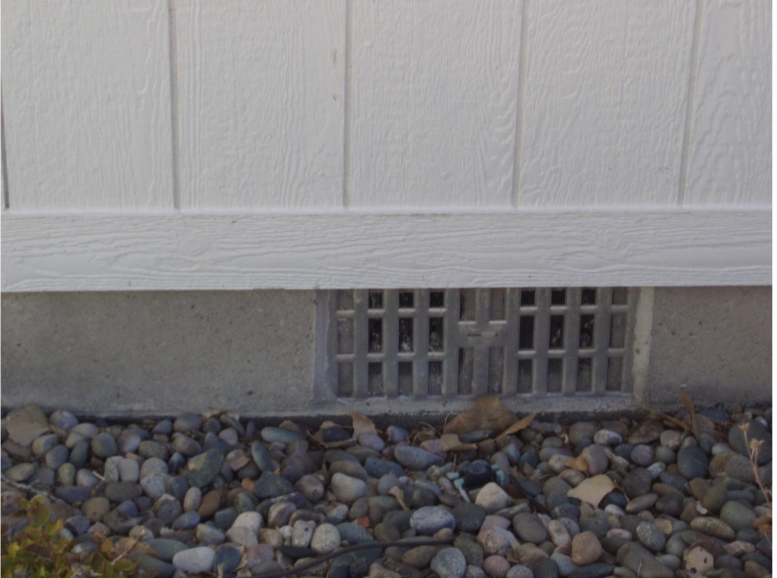
Vent in crawl space

If submitting more photographs than will fit on the preceding page, affix the additional photographs below. Identify all photographs with: date taken; "Front View" and "Rear View"; and, if required, "Right Side View" and "Left Side View." When applicable, photographs must show the foundation with representative examples of the flood openings or vents, as indicated in Section A8.