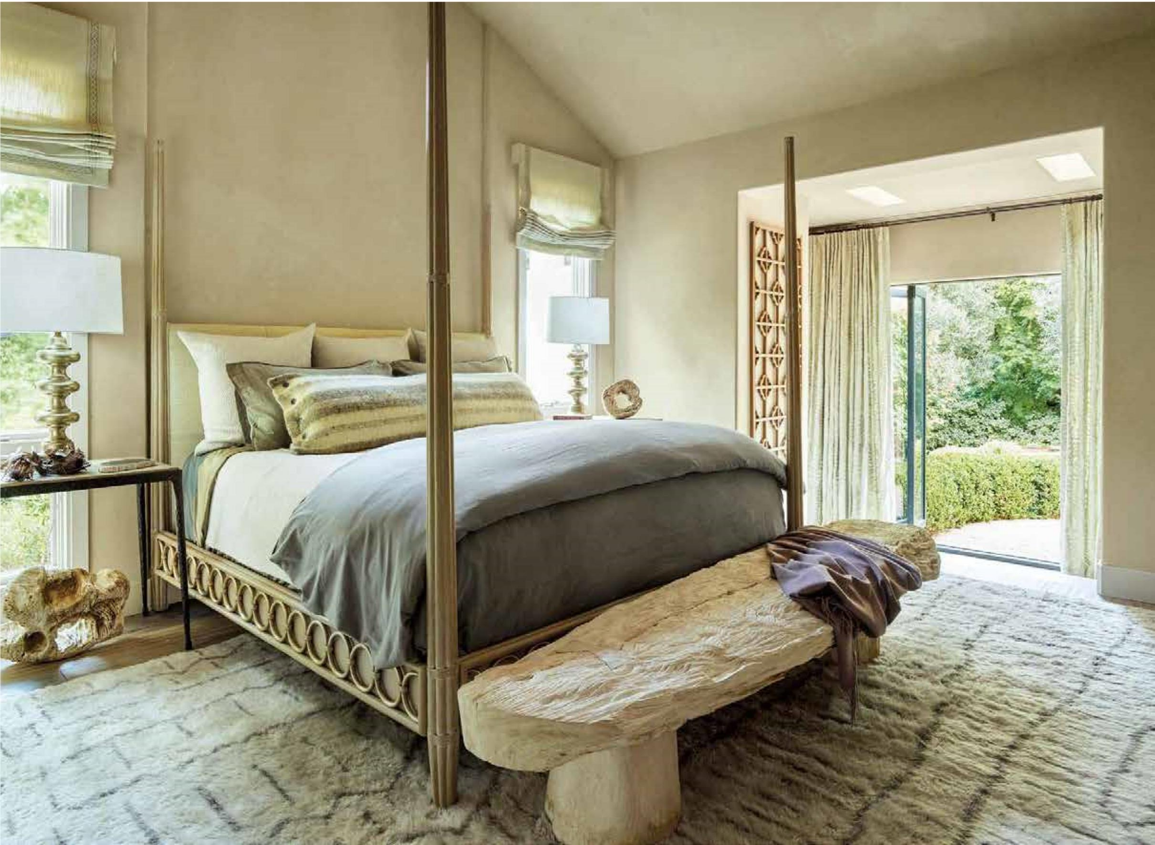
The owners’ McGuire four-poster bed, accented with a lumbar pillow by Cade Home, and Moroccan rug act as focal points in the light-filled master bedroom. A rustic wood bench from SummerHouse lends further texture to the space. The accordion-folding door is by LaCantina Doors.