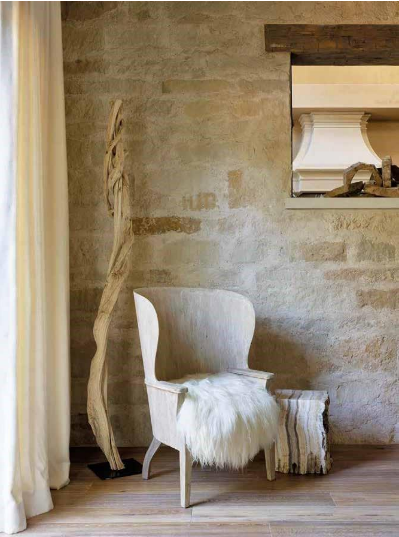
A Formations Wooden Barrel chair from Shears & Window stands near the living room's limestone wall. The oak floors are by Francois & Co. and were installed by Raffo's Hardwood Floor Co.