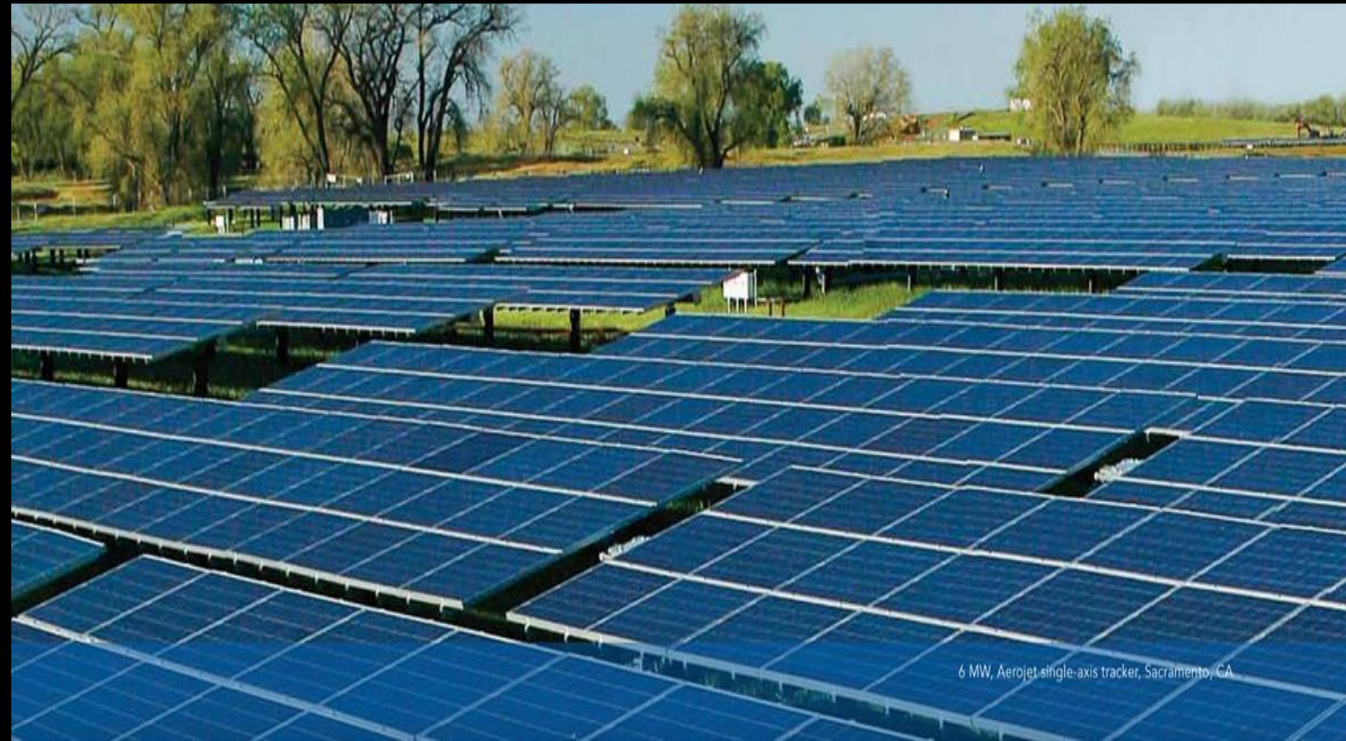
6 MW, Aerojet single-axis tracker, Sacramento, CA