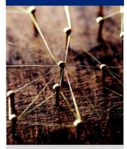
Learn the fundamentals of networking and prepare for a career in a new and fastgrowing field.

There's Still Time to Enroll www.ahpcbiz.com