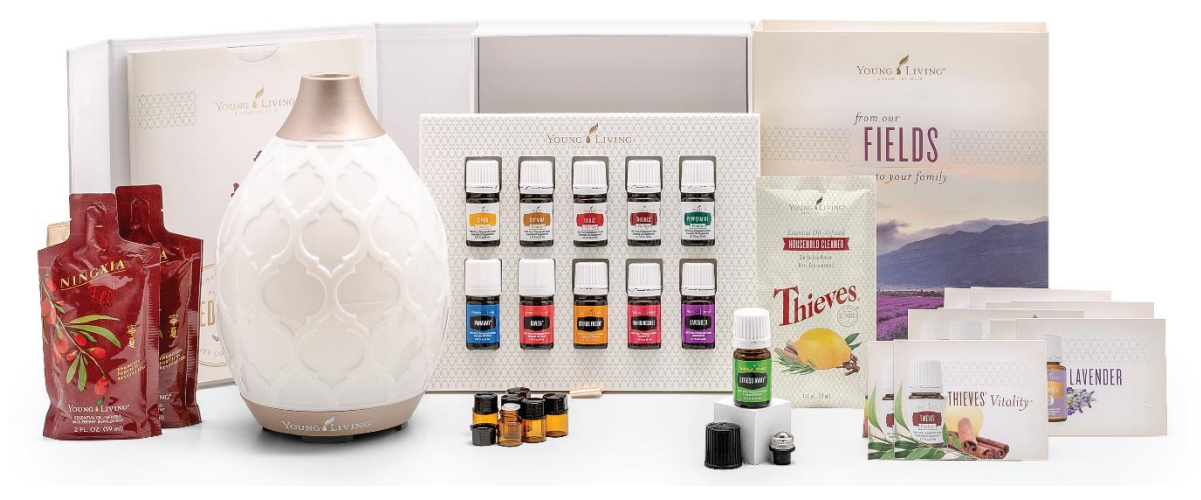
Choose your own diffuser...