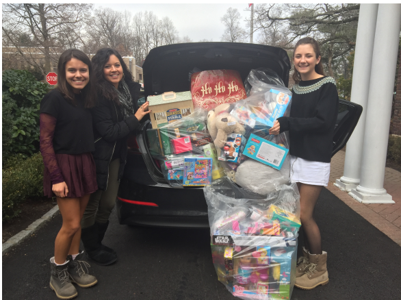
Members of the Girls' Club with just a portion of the donations collected for the Wynona's House holiday toy drive.