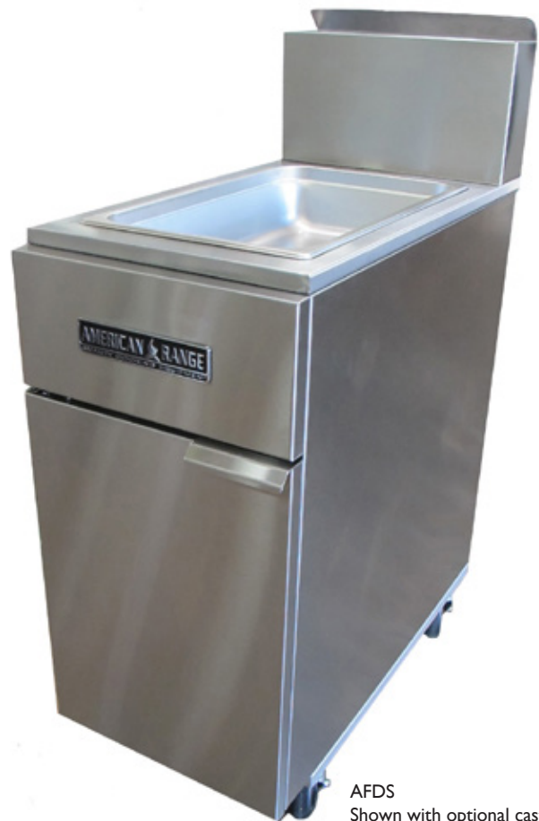
AFDS Shown with optional casters