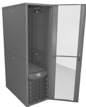
The Liebert APS UPS can be installed on raised floors, traditional flooring, or in rack enclosures.