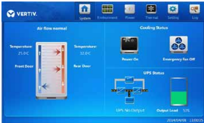
Large touch panel LCD display provides easy access to all information about power, thermal management, environment, alarms, and settings.