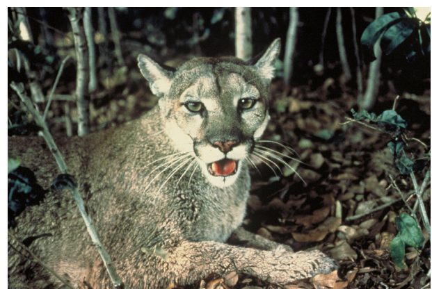
TRENDS in Ecology & Evolution

via GR. The only way out of this intensive management cycle is to add habitat and populations with gene flow among them.