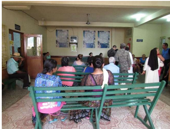
Typical Day in the Waiting Room at the Clinic, Santa Elena

But we are sad to report that there is increased violence, resulting in more and more "vulnerable" situations (e.g., the two girls, sisters, raped by their stepfather, as reported in last year's newsletter). With the full support of the community, the Sisters plan to take in about 20 "vulnerable" girls in 2020 who will reside in the dormitories (built in the mid-1990's with OCIMA's help). Not only will this provide a safe environment for these young girls, they will receive an education at the school and will be supported by social workers, counselors, psychologists and lawyers who will participate in their healing process. The expectation is for the girls to be able to return to their families with the tools to cope and succeed in life. This will require additional funds to support the network of medical and legal professionals needed to make this program successful.