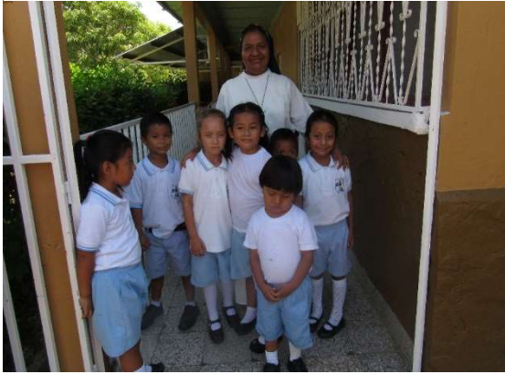
Day Care Center, 2019

tailoring. Building maintenance is critical in Guatemala's humid climate and OCIMA's funds go primarily toward maintaining the facility. Due to increased concern for the safety of the Sisters at San Benito, OCIMA installed security bars on the windows at this facility earlier this year. During the night, people were trying to break into the buildings where the Sisters were sleeping.