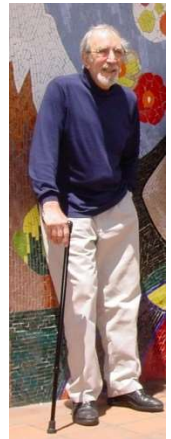
Standing Outside Clinic, Quito, 2003