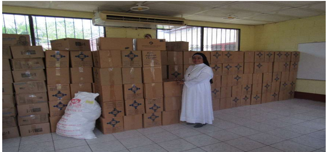
Nutritional Center, Morales, After Receiving Food Shipment

prescription drugs for the dispensary and assist with difficult and sensitive medical situations. Malnutrition is a serious concern in this area and the food that we pack with your generous donations here in the States and ship to Guatemala are well-utilized in Morales (as well as in Santa Elena at the Food Distribution Center noted above). This specially-formulated food is reserved for the most severe cases of malnutrition. The Sisters appreciate having this food because of its nutritional value and it stores well in Guatemala's humid climate. It has been three years since our last food packing and we are overdue in sending food to this region. We obtain this specially-formulated food through the Kids Coalition Against Hunger. To pack approximately 100,000 meals, it requires $27,000.