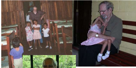
Nutritional Center, 2005