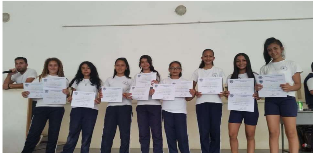
This Past Year's Graduates with Their Degrees