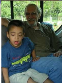
School for Children with Special Needs, 2006 (Teachers graduated from Santa Rosa)