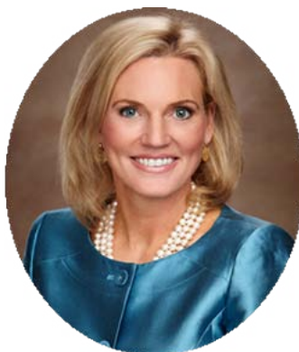
Heather Fitzenhagen Florida House of Representatives