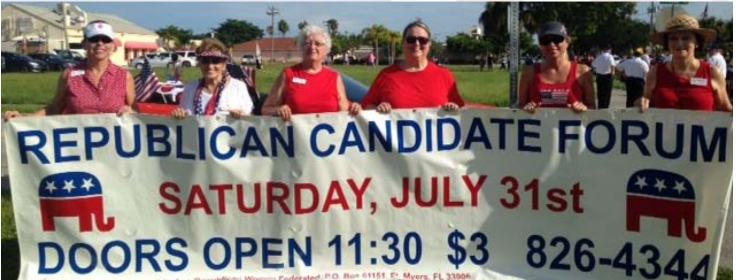
LRWF Women had a GREAT time at the Veteran Heroes' parade in Cape Coral! Oooooops! Someone forgot to read the banner! Well, you can't say we don't have fun!