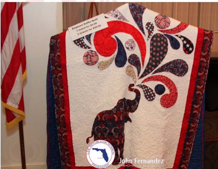
Our Patriotic Elephant quilt was on display for all to enjoy!

IF YOU MISSED ALL OF THIS FUN... MAKE SURE YOU GO TO THE NEXT LUNCH MEETING ON AUGUST 10TH.