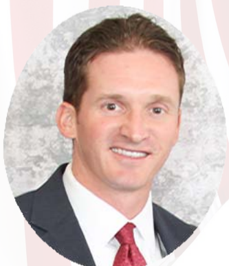
Dane Eagle Florida House of Representatives

Click on Pictures to View Their Websites