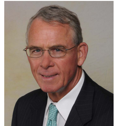
Francis Rooney US House of Representatives

Without comprehensive action to address all of the factors which contribute to the environmental disasters plaguing our Southwest Florida community, the damage will continue. The health of our people and our economic livelihoods are at stake.