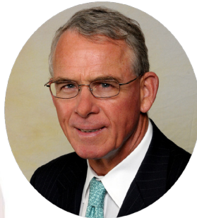
Francis Rooney U.S. Congressman Dist. 19