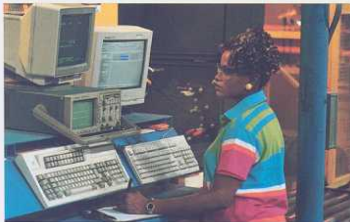
Computerized final test stations perform a complete series of electrical tests prior to shipment.