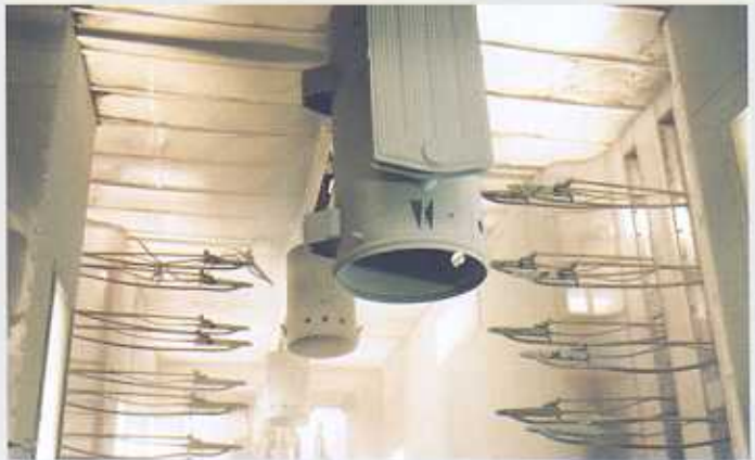
Electrostatically applied powder paint provides a durable, corrosion-resistant finish.