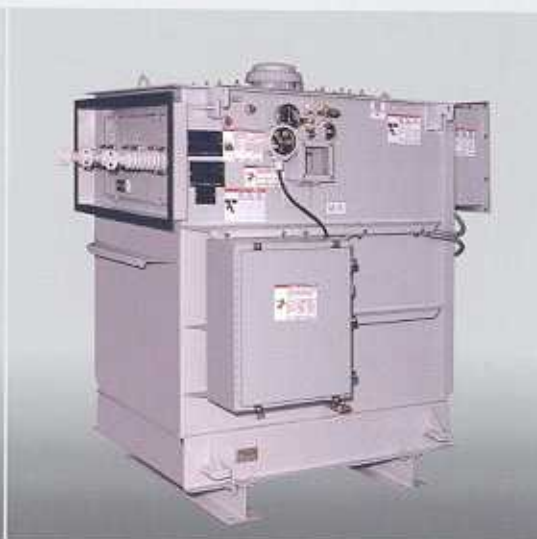
(left) Illustration of secondary unit substation with sidewall mounted high-voltage and low-voltage bushings, and mounting provisions for interconnection with high-voltage and low-voltage switchgear