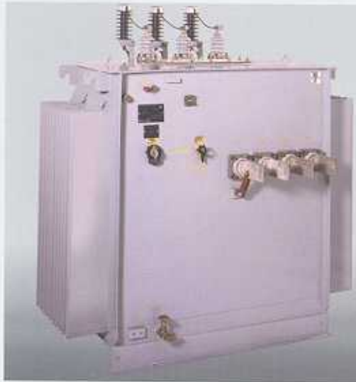
(Far left) Illustration of secondary open substation with cover mounted high-voltage bushings and front mounted low-voltage bushings.