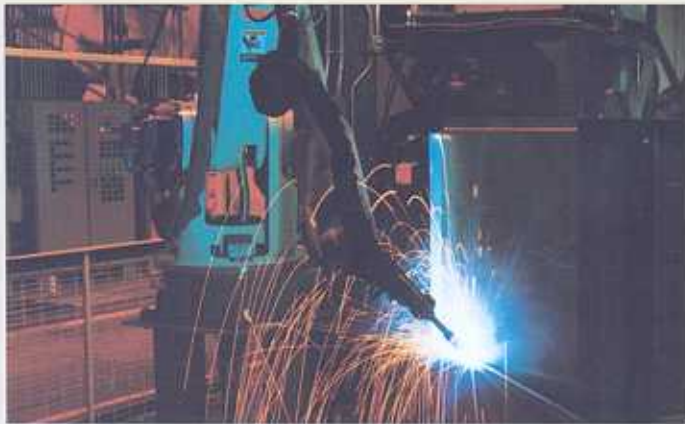
Automated and robotic welders perform 100% of all oil-compartment seam welds.