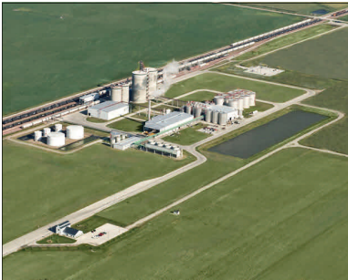
Aerial View of the Ethanol Plant at Fairmont

Advanced BioEnergy LLC, headquartered in Bloomington, MN announced that they have finalized the sale of the ethanol plant in Fairmont to Flint Hills Resources. Flint Hills Resources is a leading refining, chemicals and biofuels company with headquarters in Wichita, Kansas. The purchase price was listed at $160 million plus an estimated $15 million of assets according to the Securities and Exchange Commission.