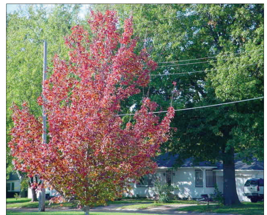
HOP program offers down payment assistance