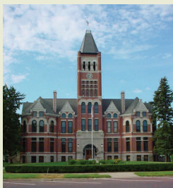
Fillmore County Courthouse