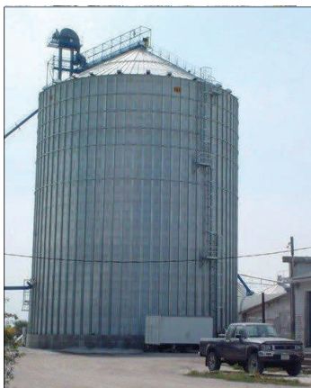
New 300,000 bushel bin added at Geneva Milling

That leaves 33,000 sq. ft. that can be utilized for another purpose. Anyone interested should contact the County Clerk.