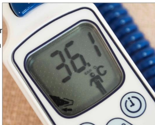
Infrared Thermometry LCD Screen