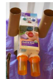
Star Wars characters created by the summer camp participants