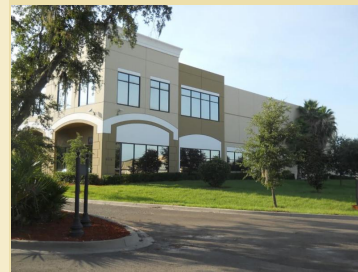
Weldon Industries Tampa, FL