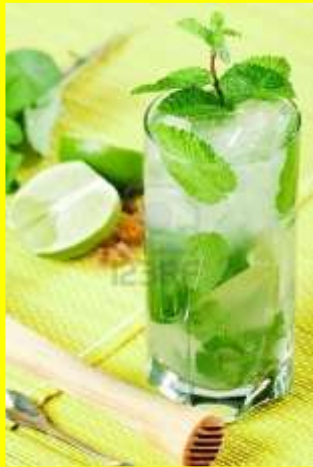
Mix for Mojitos