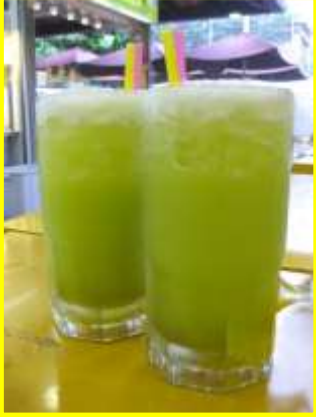
Serve Over Ice