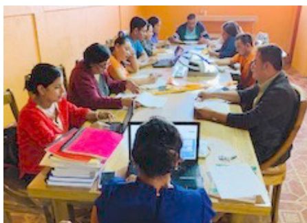
Teachers in conference