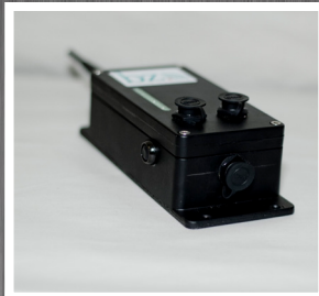
bz Sensor Interface