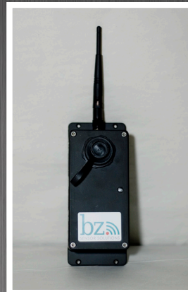
bz Control Center Interface