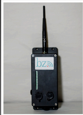
bz Control Interface