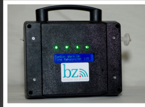
bz Gas Detector