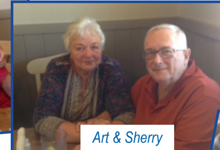
Art & Sherry