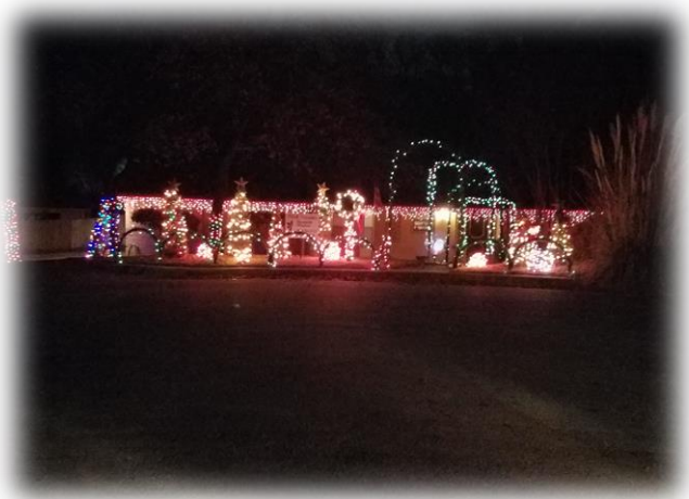
Honorable Mention – The Prathers – 312 Oak Hollow Ct.