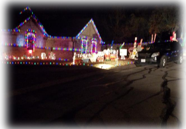
1 st Place – The Bootens 112 Oak Hollow Ct