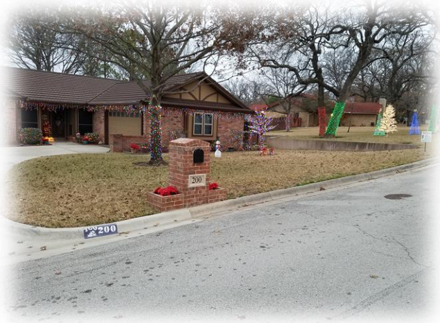
2 nd Place – The Paynes – 200 Valley View Ct.