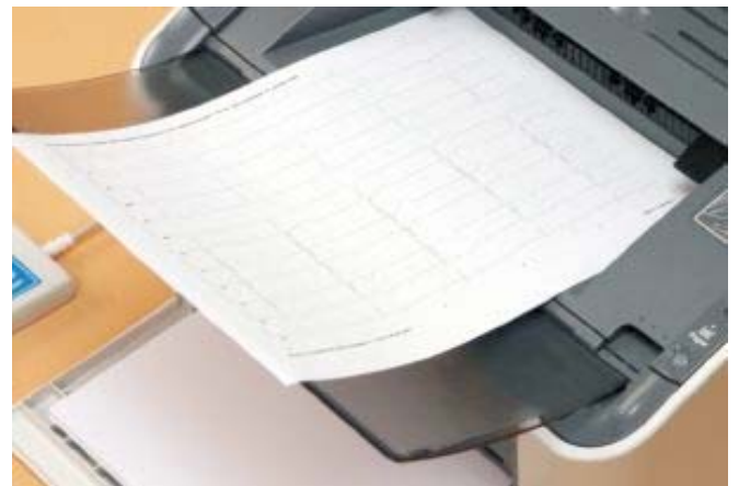
High Quality Report Printout