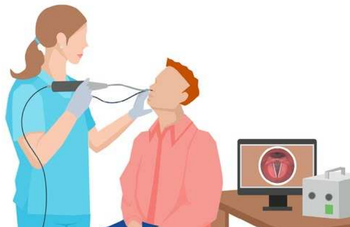
Fiberoptic Endoscopic Evaluation of Swallowing