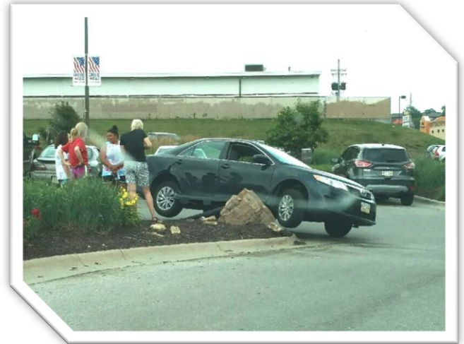
The newest graduate of the Perry Dawes Driving School.

***Please remember to bring non perishable goods for the Food Bank to the monthly meeting. Also bring small unused toiletries you have from hotels for Mohm's Place, a shelter in Council Bluffs.