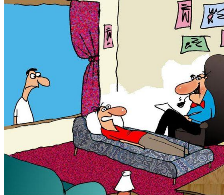
"I think I'm suffering from paranoia. I parked too close to a guy's Corvette, and I think he's been stalking me ever since."