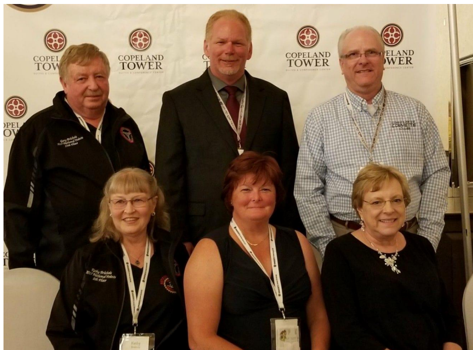
Figure 1 CCC representation in New Orleans. Congratulations on being NCCC National Champions again.