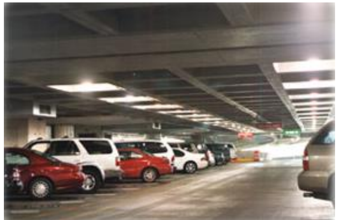
Challenges to deploying the video based counting system included lighting, weather conditions, headlights, speed of cars passing, color of cars, cars driving in the wrong lanes, high profile vehicles and very low camera mounting heights

Now fully operational, the new system uses 108 cameras throughout the garage. PureActiv software analyzes the video feeds , detects moving cars, and keeps track of how many cars are parked in each section. Signs at entrances of each level tell drivers which direction to proceed and how many spaces are available in each section.