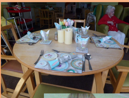
We embraced the new fashion of having Easter crackers