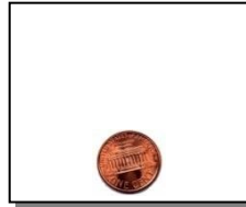
Jar B Without Magnification (control)

3. Put lids on jars. Set both jars in the sun. Use the magnifying lens to focus sunlight onto the penny in Jar A. You will record the temperature every five minutes.