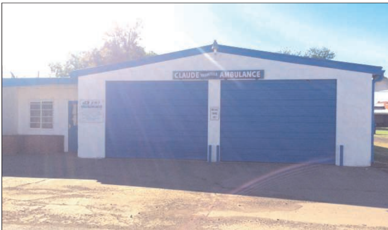
Claude EMS has been temporarily suspended until a number of issues involving staffing, administration, communication, and finances can be resolved.

In an effort to find that solution, an unofficial meeting was held at City Hall on Thursday, June