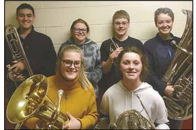
The CHS Brass Ensemble is on its way to State Competition.