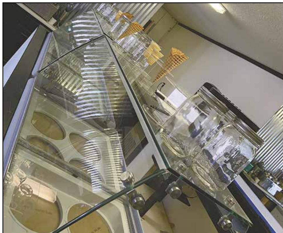
Pendelton's will occupy the former showroom at GraphicINK. It will be a fun and welcoming hangout for the whole community.

Chamber of Commerce has a renewed vigor in supporting the city of Claude. Both of these agencies are fully on board with Pendelton's