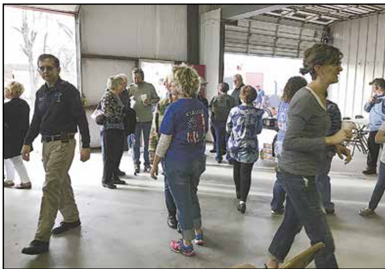
Hundreds of Armstrong County residents attended the EMS Grand Opening and Ribbon Cutting at the new EMS station.

People poured into the new station and were able to explore the many rooms that are designed for specific purposes necessary for today EMS and the future. Rooms are set up for training, debriefing, laundry, kitchen for meal prep and serving, eating, sleeping and for meetings. When asked what the benefits of having this new building are, Shay Hand, member of the EMS said, "Many. Just as in the case of the house fire last week. Even though the building wasn't completely finished, resources were able