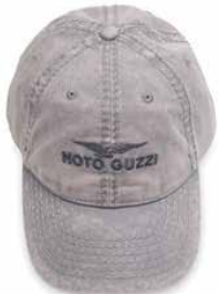
BAMBINO/KID ..... COD. 606373M

6 panels hat with sandwich visor and white piping. Engine logo embroidered on the left side and Moto Guzzi label on the left edge.