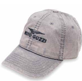
UOMO/ADULT ..... COD. 606372M

100% cotton twill hat, with all-thread patch & embroidered Moto Guzzi logo, perfectly match elegance and top quality of fabric with the proud Moto Guzzi style.