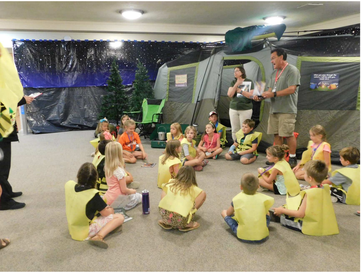
We had so much fun at Vacation Bible Camp!