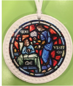
New for 2019