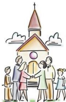
Back To Church Weekend