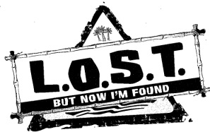
An Island Adventure musical for children

Friday, April 12, 7:30 pm - at St. Peter's Church