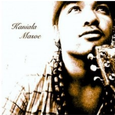
Live Entertainment by Kaniale Masoe