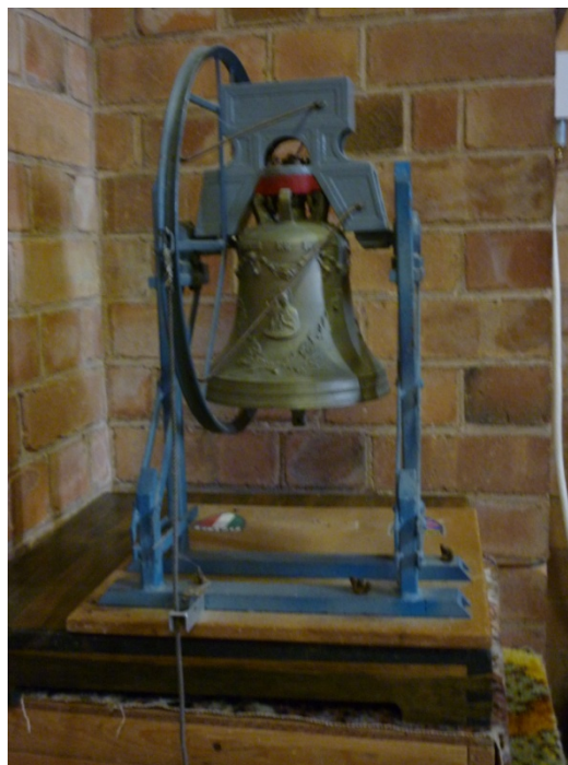
Model of Italian Bell