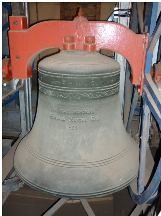
The Tenor Bell