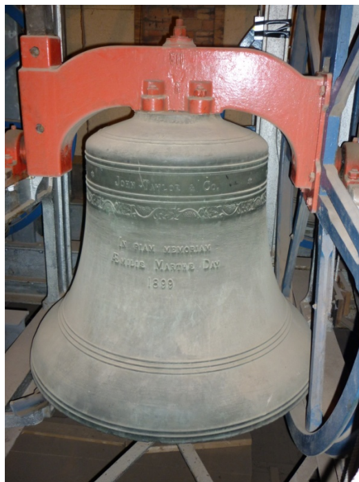
The Tenor Bell