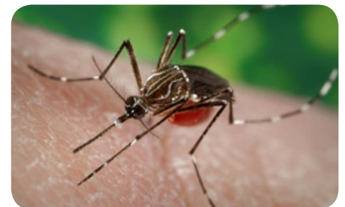
Female mosquito after biting a person.