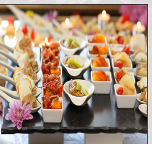
Asstd. Hors D'oeuvres